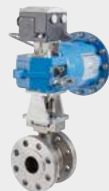
Eccentric plug valves