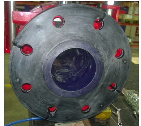
Polyurethane (PU) is widely used in all industries to protect parts and components from wear and abrasion.

Only part in contact with the abrasive slurry is the abrasion-resistant polyurethane inner lining of the sleeve.